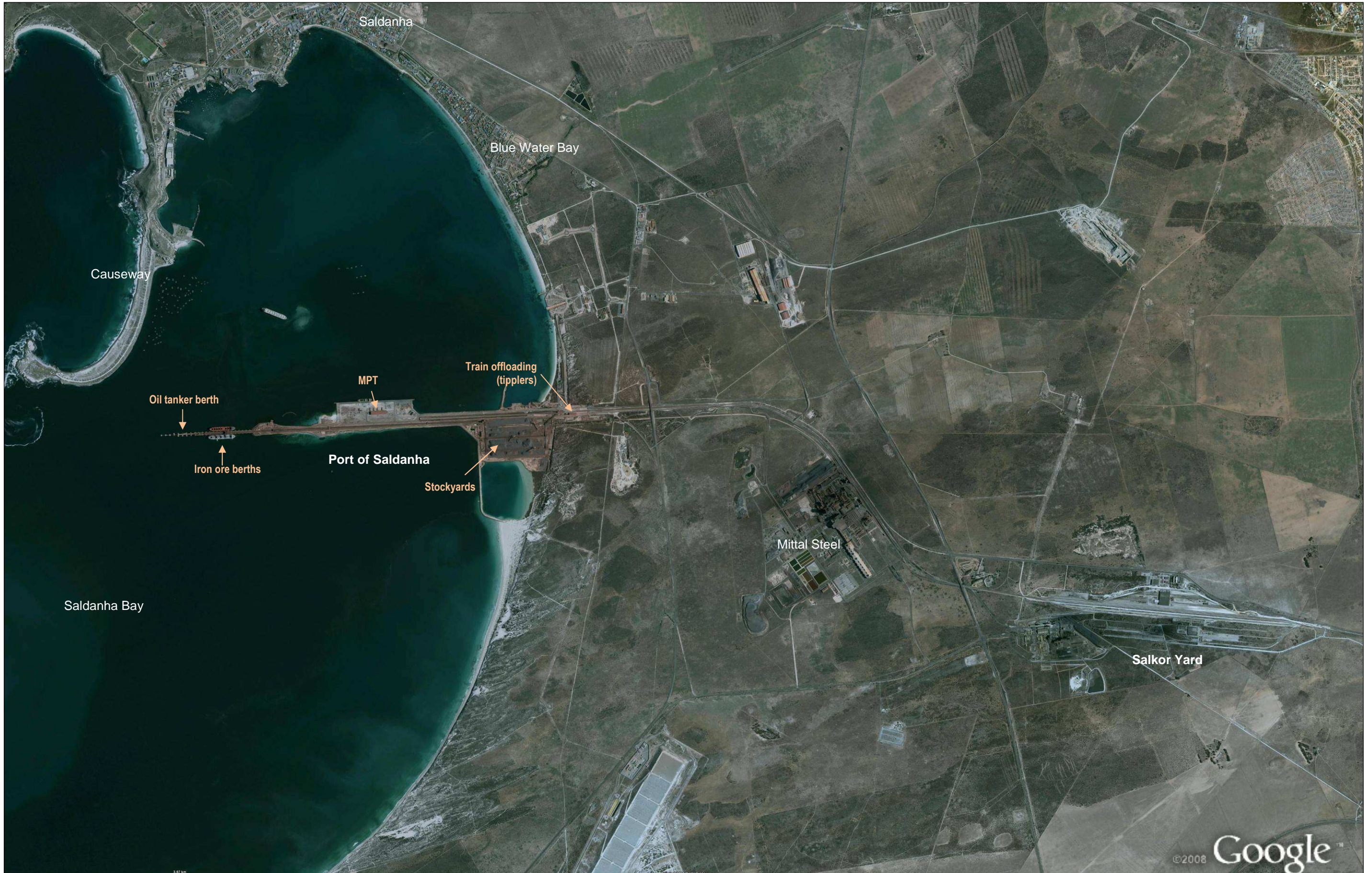
Plate 1: Aerial view of the Iron Ore Handling Facility at the Port of Saldanha and Salkor Yard