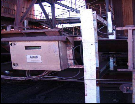
Online Moisture Analysers