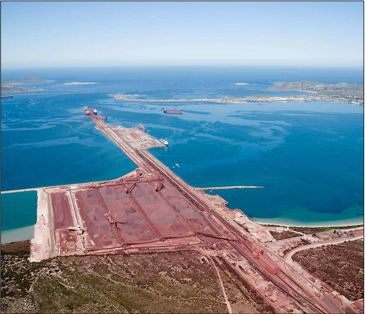
Plate 2: Aerial view of the Iron Ore Handling Facility at the Port of Saldanha