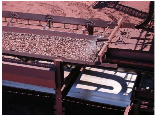
Water sprayer at transfer point