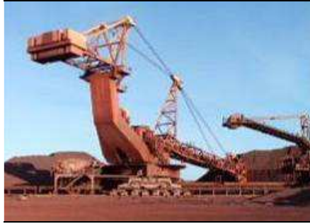
Stacker / reclaimer