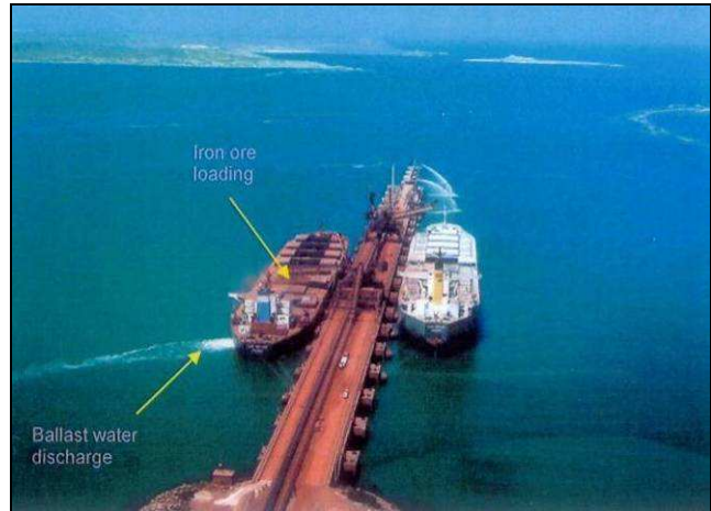
Iron ore carrier berths