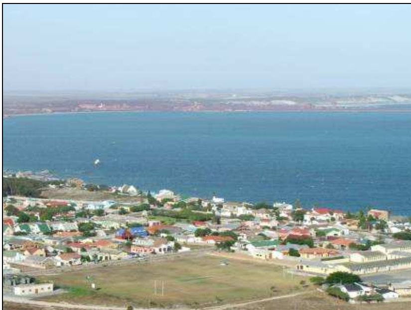
Photo Plate 1: Aerial view of Saldanha with the port in the background.